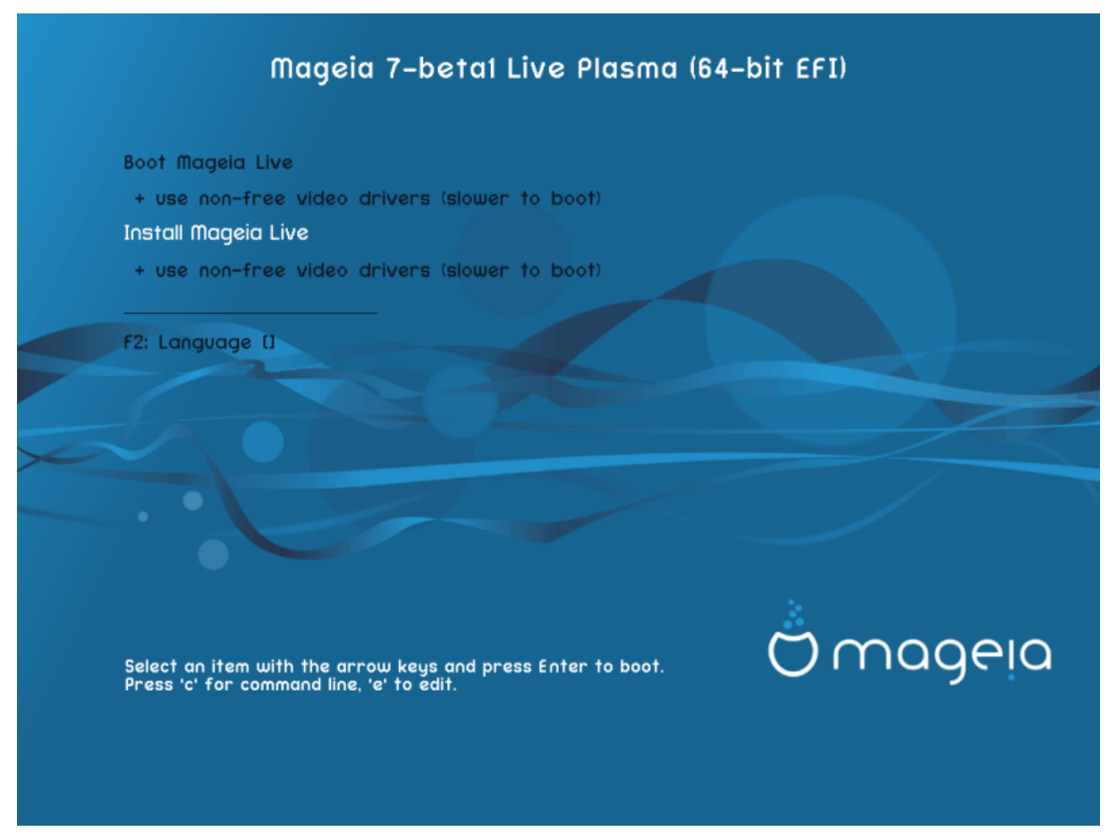
First screen while booting in UEFI mode